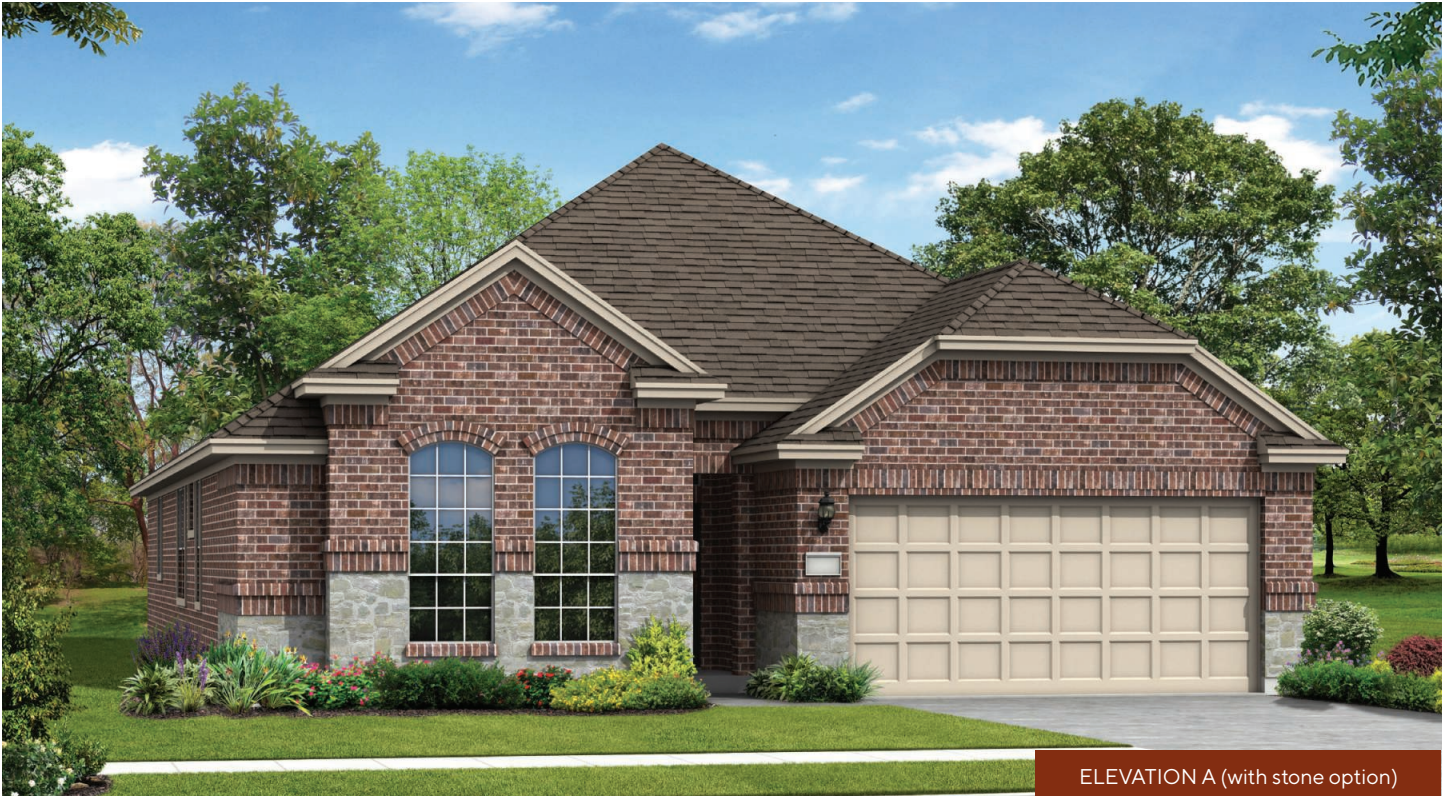
ELEVATION A (with stone option)