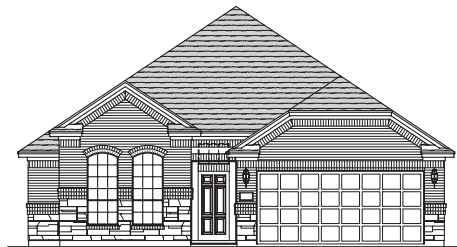
ELEVATION A (with stone)